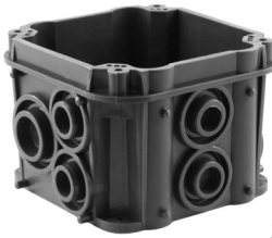
372 101 747 - 1004 (compatible with sealing plate 372 800 007 - 1004/3-1)

... since 1966 - with improved geometry for installation in combustible walls and cavity walls